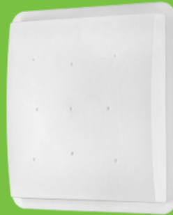
UHF 5 series