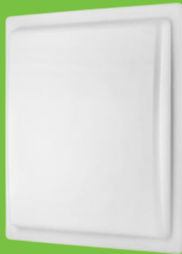
UHF 10 series